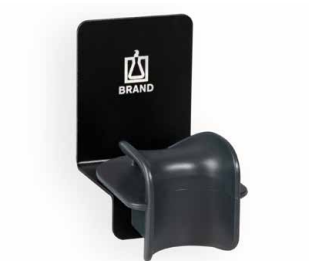
Wall mount for 1 Transferpette® S single- or multi-channel pipette.