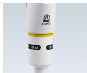
Integrated shaft coupling