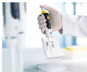
Working with PCR plates