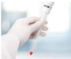
Narrow centrifuge tubes

Individual nose cones and seals can be easily removed for cleaning or replacement