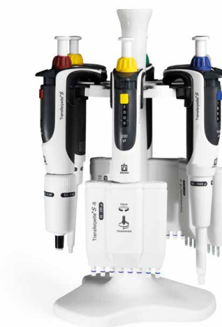
Bench top rack for 6 Transferpette® S single- or multi-channel pipettes.