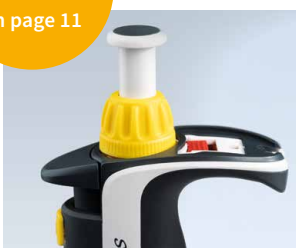
Easy Calibration technology